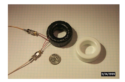
Figure 3: Toroid transformer to break the cable-braid loop.