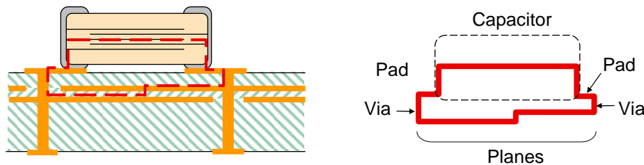
Figure 1: On the left: side cross section view of a mounted bypass capacitor. On the right: contributors to the loop inductance. The red line represents the current loop.

Figure 1 will help us to understand the reasons. The sketch shows the side cross-section view of a mounted bypass capacitor. We show here a multi-layer ceramic capacitor (MLCC), but the following arguments are the same for aluminum electrolytic or tantalum capacitors as well. The capacitor is shown mounted to surface pads on the PCB. For sake of simplicity, only those two layers are shown in the board, where the capacitor connects.